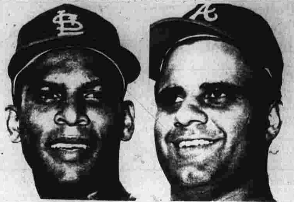
GOING TO THE BIRDS—Joe Torre, (r) of Atlanta Braves, was traded to World Champs, St. Louis Cards for All-Star first baseman Orlando Cepeda (l).